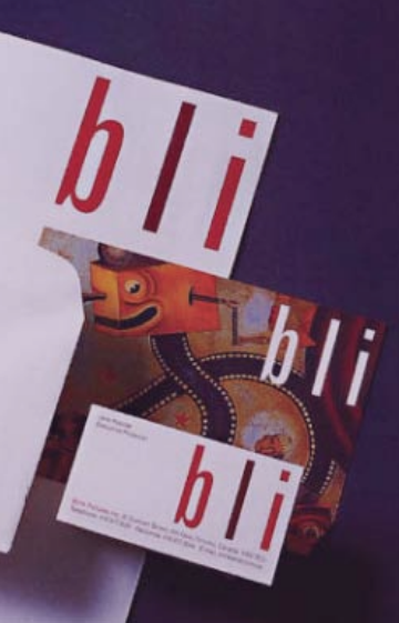
Blink Stationary, 1997, Concrete Design Communications, Inc. (Branding Design)

to empower designers through information, inspiration, EDUCATION, recognition and advocacy